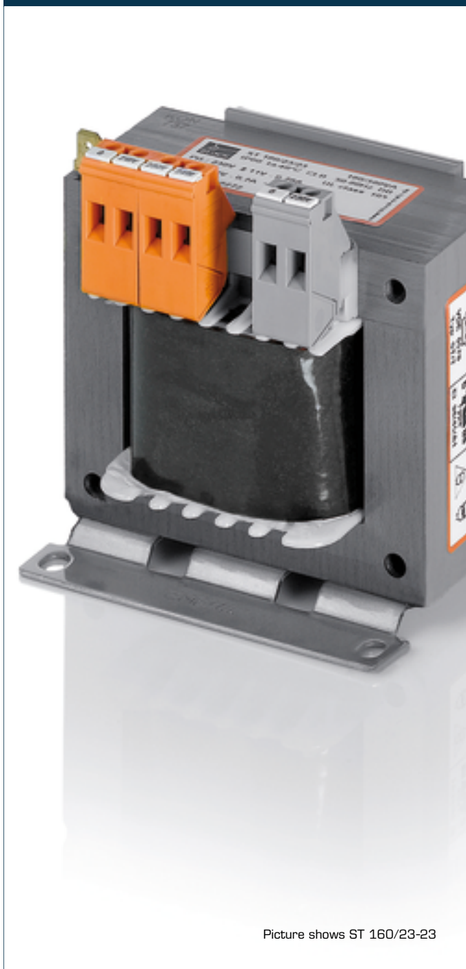
Picture shows ST 160/23-23