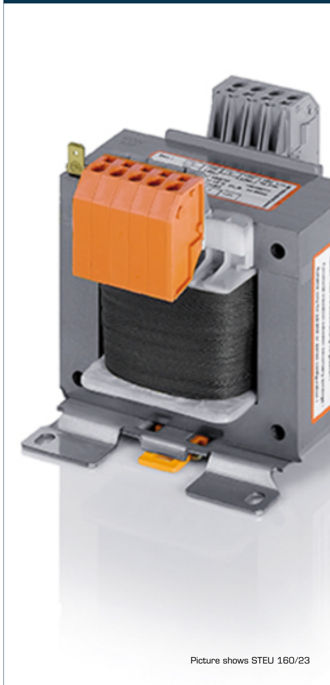
Picture shows STEU 160/23