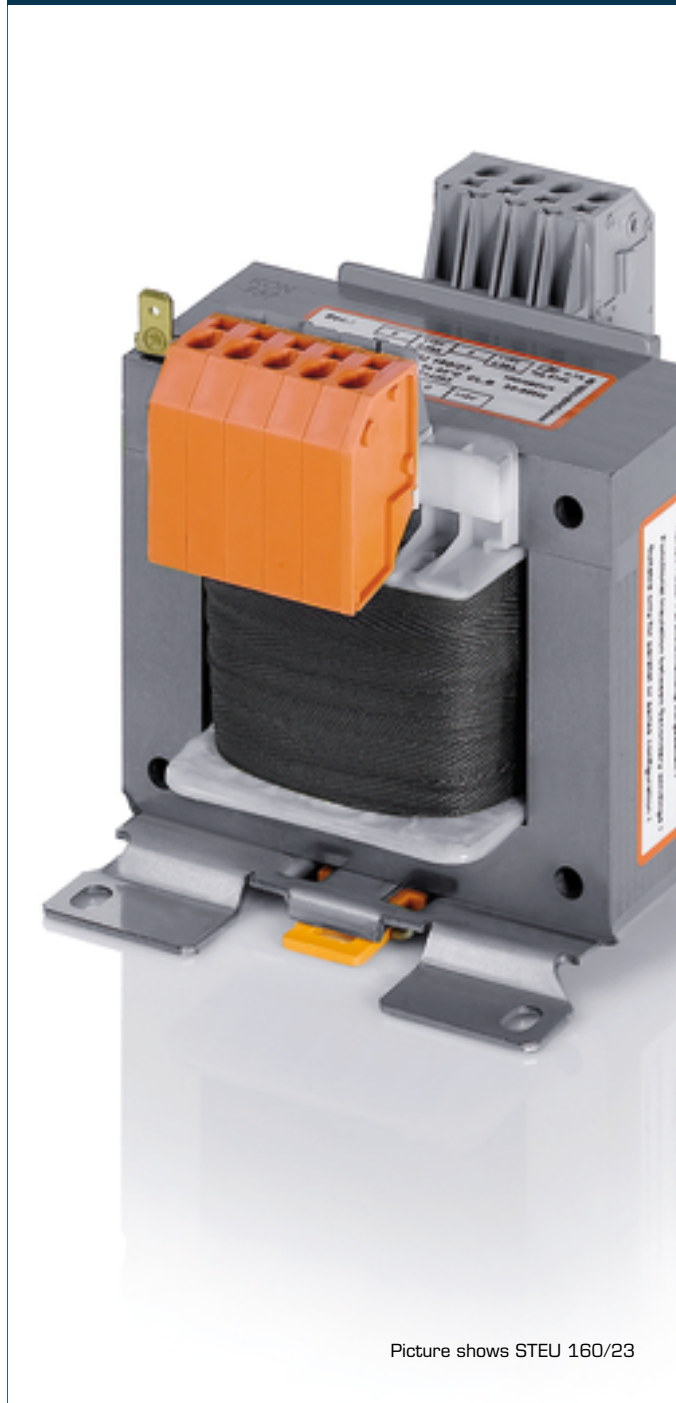
Picture shows STEU 160/23