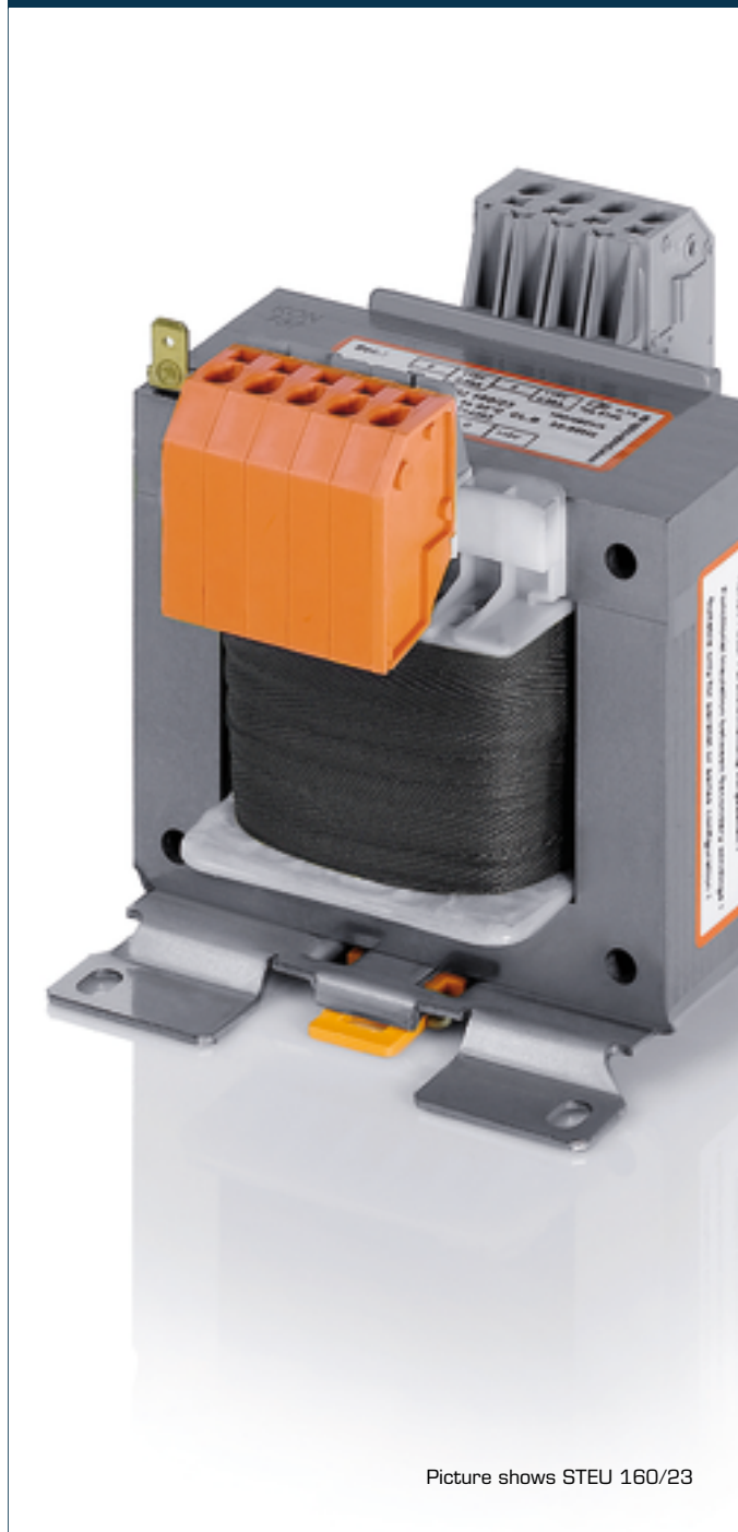
Picture shows STEU 160/23