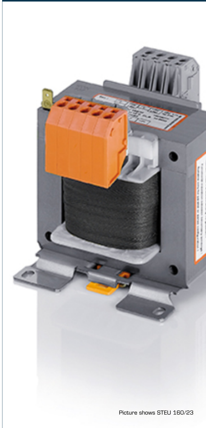
Picture shows STEU 160/23